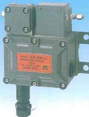
Sample drawing type

Approval No.38169(GD-D8) in Japan Approval No.C13918(GD-D8DC) in Japan